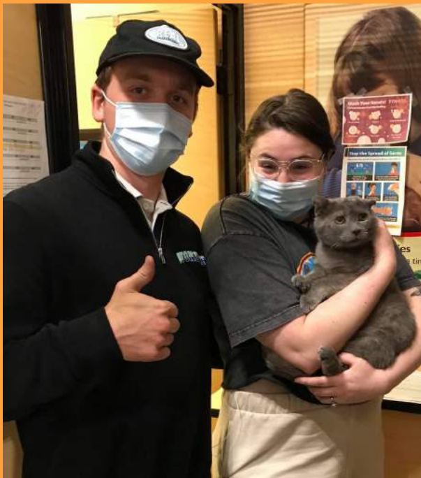
Banjo with his new family!